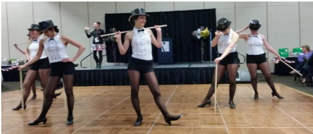
Richard's School of Dance perform "Top Hat"