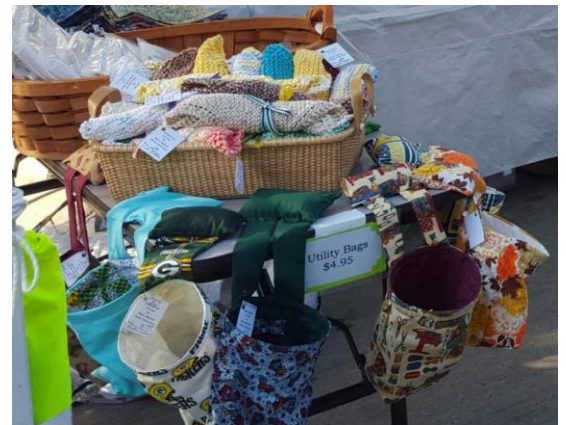
Samples of some of the items sold at the MMCV booth