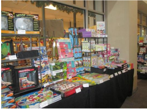
A sample of items available during the Books are Fun sale.