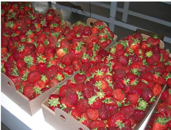
The Strawberry Sale offered scrumptious berries