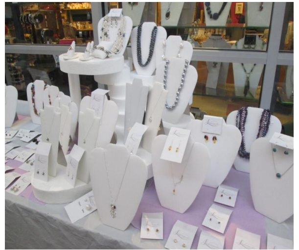
Some of the many items offered at the jewelry sale