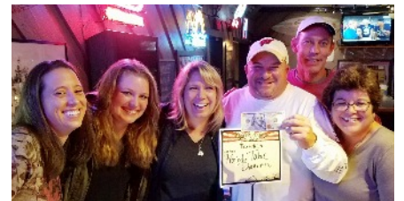
First place trivia winners "The Periodic Table Dancers"