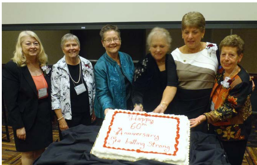
Past Partners of WHA presidents