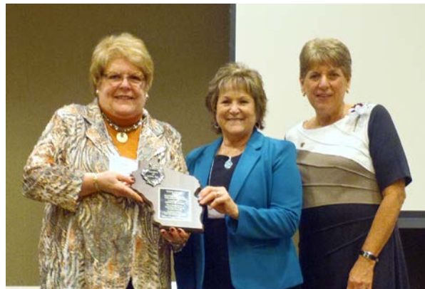
Mercy Health System Association of volunteers, Janesville