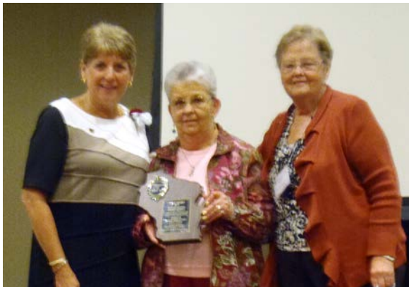
Auxiliary of Riverside Medical Center, Waupaca