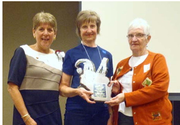
Langlade Hospital Auxiliary, Antigo