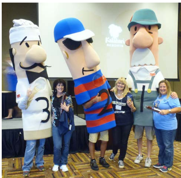
Milwaukee Brewers Racing Sausages