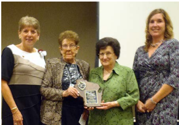
Memorial Health Center Volunteers, Medford